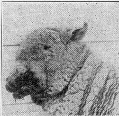
Fig. 2. Screw-worm damage following soremouth infection.

less permanent stunting of the animal. The largest part of the severe annual losses in lambs and kids is due to the damage done by the larvae of the screw-worm fly, Cochliomyia americana , (Cushing and Patton (2)) which infest the inflamed, swollen lips of the animal suffering from the infection and cause its death in many cases (Fig. 2). Such annual losses, in past years, have amounted to hundreds of thousands of dollars. The disease has been prevalent in these regions for the past quarter century and longer, becoming more and more prevalent with the fencing of the range. Obviously the infection in these pastures has been intensified from year to year by the repeated dropping of the infectious scab, which is very resistant to weather and soil conditions, on the range.