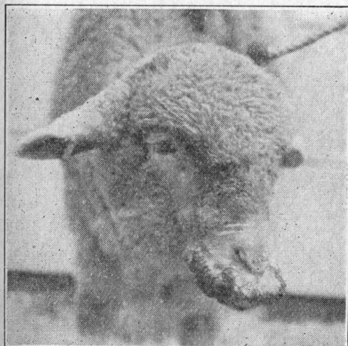
Fig. 1. Typical soremouth (contagious ecthyma). This photograph was taken on the 14th day after infection.

In the Edwards Plateau and Trans-Pecos regions of West Texas, uncomplicated cases of contagious ecthyma run a course of 25 to 30 days and heal spontaneously, leaving the lips smooth and without scars. Direct losses from the disease itself are confined to shrinkage and the more or